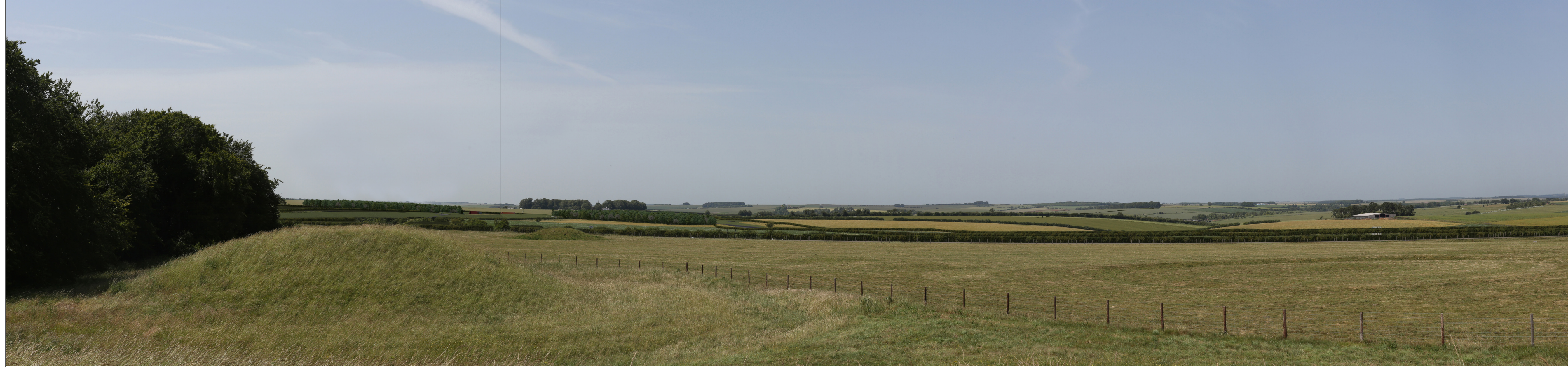
PROPOSED (SUMMER YEAR 15)